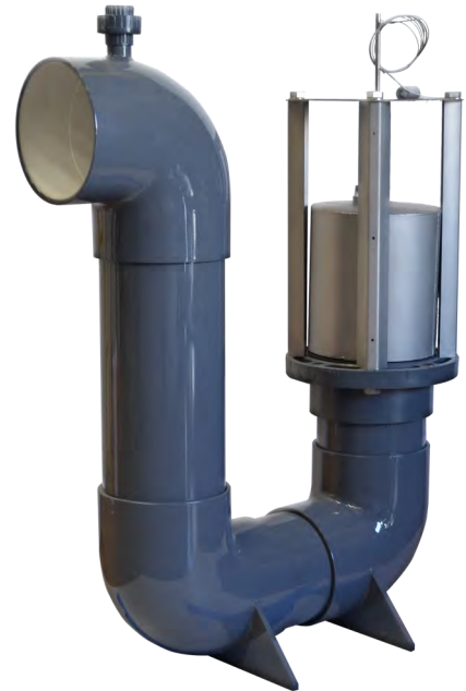
OSV-8 in PVC

Large, unpredictable oil spills can defeat even the most conservatively designed pollution control systems. The OSV is an economical option used to confine hydrocarbon spills to the premises for safe disposal. AFL's OSV is fabricated from either non-corrosive Stainless or PVC and has only one moving part, the ballasted float. When an oil spill occurs, the float loses buoyancy as the oil level increases until it finally seats on the discharge port, closing and confining the spill.