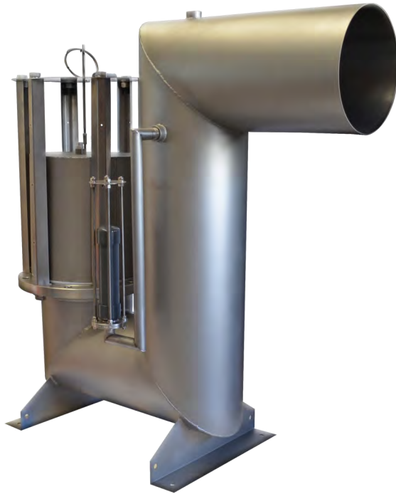
OSV-12SST w/ Slave Valve

Prevents discharge of oil spills to sewer and storm water PVC and Stainless Steel Flow Rates 0 to 1,400 GPM